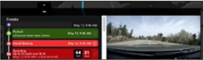
Playing remote event videos in the Raven Dashboard.

Cloud video enables remote video downloads from the Raven device. Raven detects several events from engine start to possible impact and creates short video clips of each one to be accessible remotely from the web app.