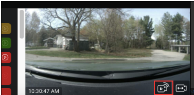
Accessing the Live Streaming feature.

Check-in on drivers when you're concerned about driver behavior or a parked vehicle in a questionable area. Raven auto-records and marks these as events so you can replay your streaming session at any time.